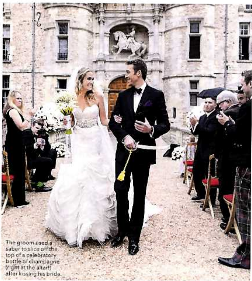
The groom used a saber to slice off the top of a celebratory bottle of champagne (right at the altar!) after kissing his bride.

PARTY ANIMALS At 2:00 a.m., the festivities moved outside for an impromptu pool party. "Some of my girlfriends jumped in with their dresses on!" says Ashlan.