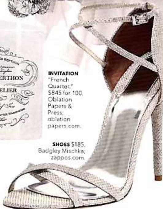
CLOCKWISE FROM TOP LEFT: ONE AND ONLY PARIS PHOTOGRAPHY; LUCAS VESSEY; CATHY CRAWFORD; STYLING BY RENE VAN ZIJ