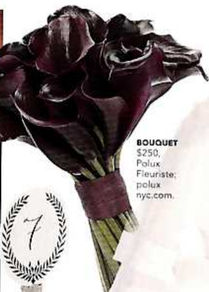
BOUQUET $250, Polux Fleuriste; polux nyc.com.