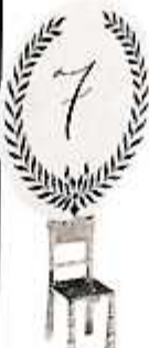
TABLE NUMBER $20 for 12, White Willow Paper; etsy.com. CARD HOLDER $26 for three, the Home Part Collection, thetrest tulsa.com.