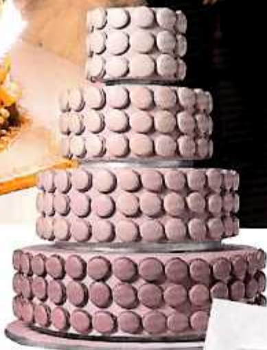
MACARON CAKE $16 per slice (serves 100), Francois Payard; payard.com