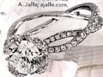
ENGAGEMENT RING $4,275 (excluding center diamond), A. Jaffe; ajaffe.com.